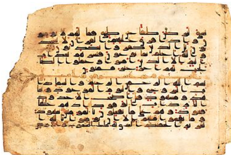
From the Yemeni Hoard: probably a ninth- or tenth-century Koran.