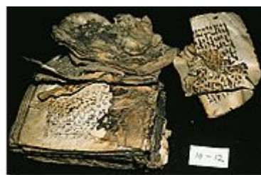
Yemeni Koran Fragments, as they were found in 1972.